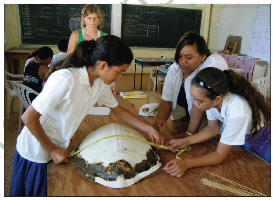
Fig. 11. Munokoa measuring curved carapace width.