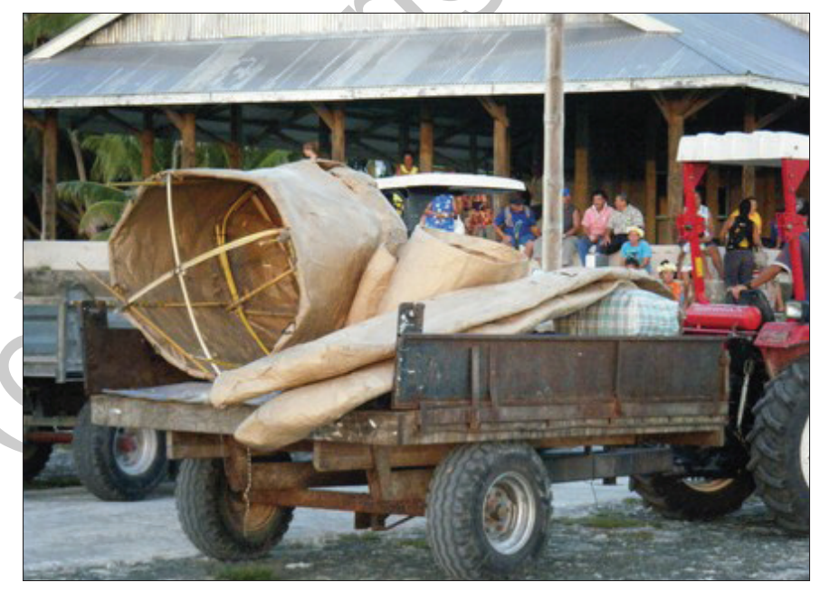
Fig. 6. Giant fonu ready to ship to Rarotonga.