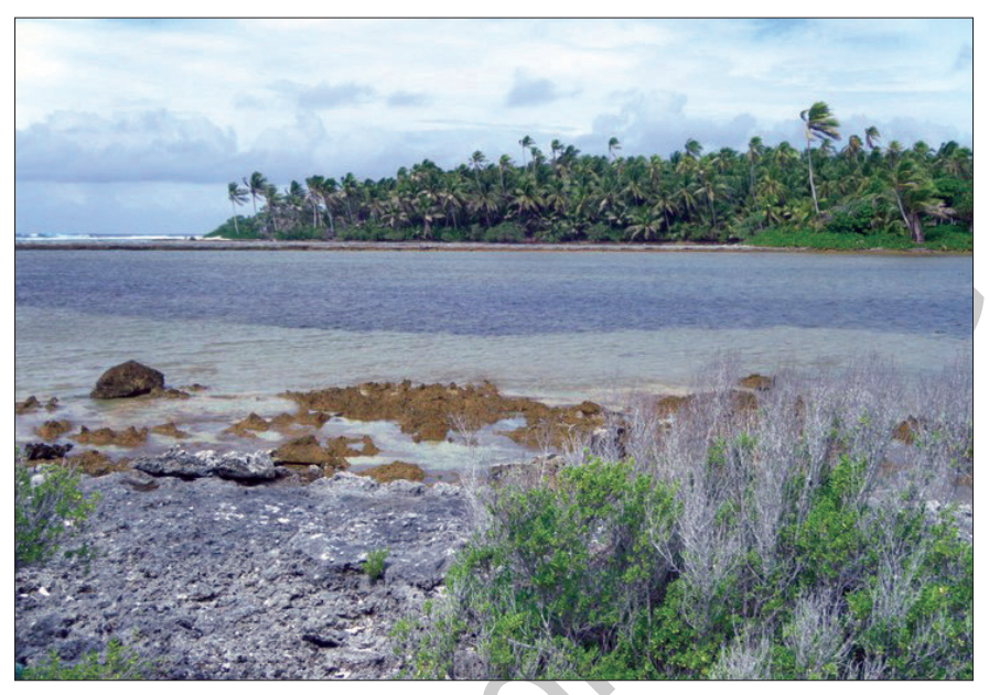
Fig. 7. Unsuitable nesting habitat.