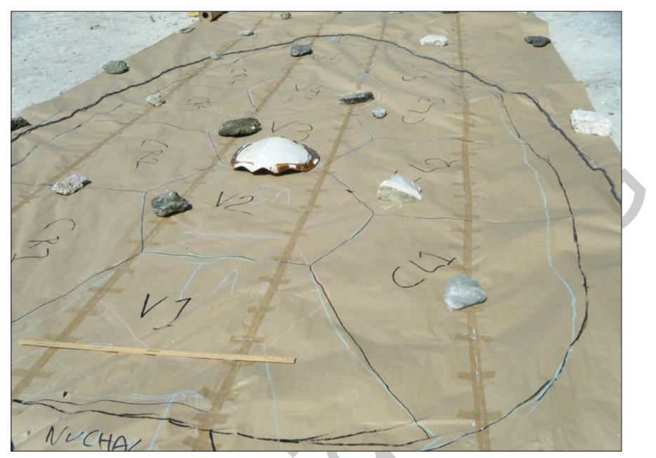
Fig. 3. Planning the carapace scutes of the model fonu.