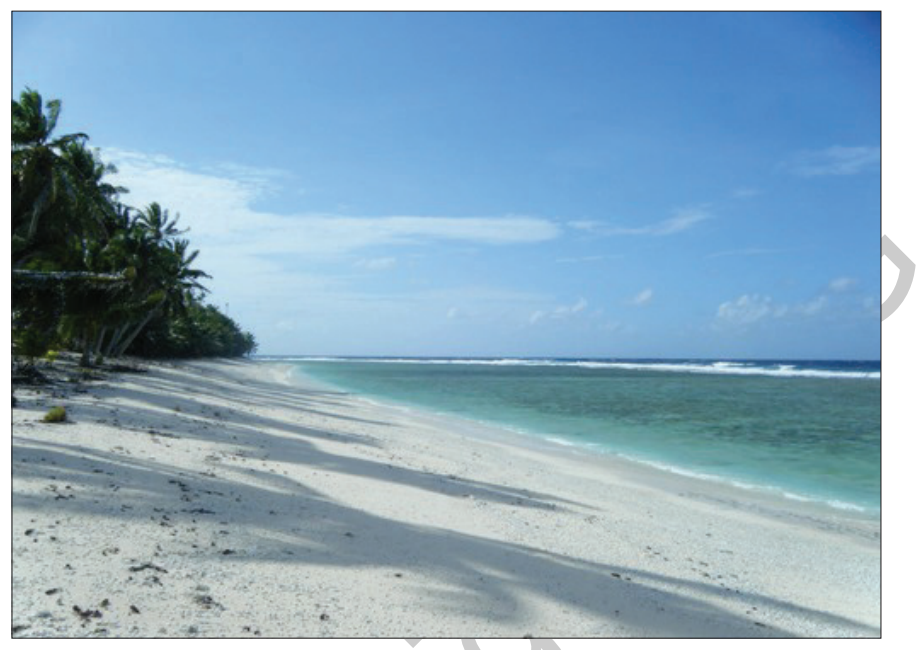
Fig. 2. School beach.

food resources would not achieve effective conservation (Colchester 2004; Torri 2011). Instead, by understanding local people and their needs, and their opinions and perceptions of marine conservation, a more culturally sensitive protective mode can emerge for endangered species, including turtles. Localised conservation projects will also have practical benefits in remote Polynesian islands and similar sites with limited financial or scientific resources (Campbell & Vainio-Mattila 2003).