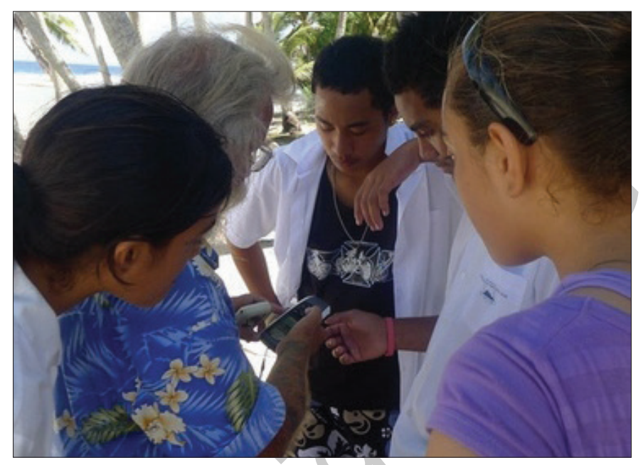
Fig. 12. Teaching GPS use.