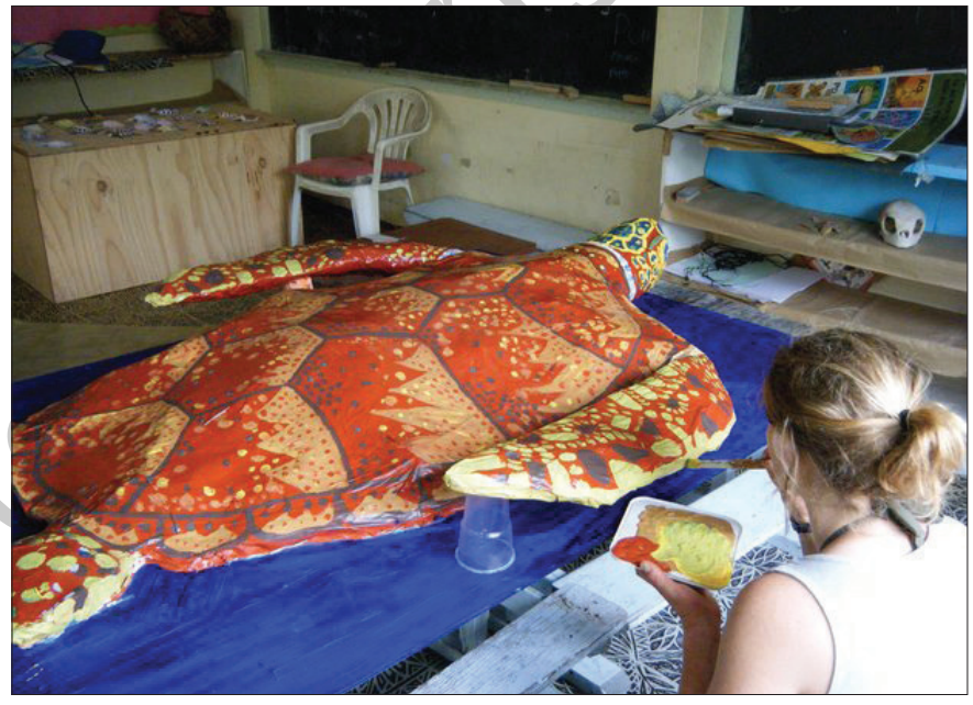
Fig. 4. Model fonu almost finished.