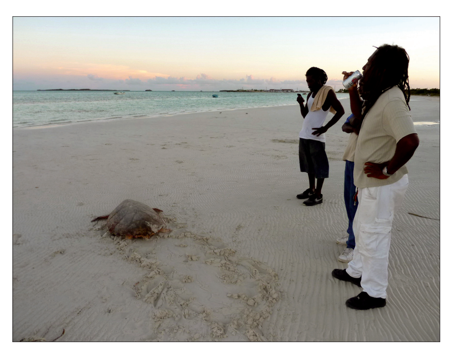
Fig. 4. A TCI fisherman (right) orders his crew to release an adult hawksbill that they had just brought back from a fishing trip, prior to the new regulations coming into force.