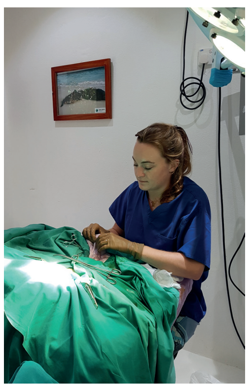
Author performs surgery to remove plastic from intestines of olive ridley turtle.