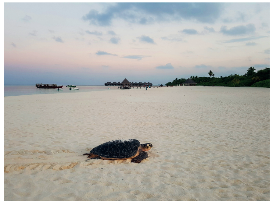
Nesting green sea turtle on Coco Palm, Maldives.