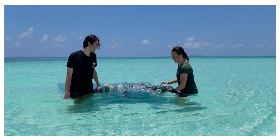
Recovering plastic debris and entangled turtle from ocean in Maldives.