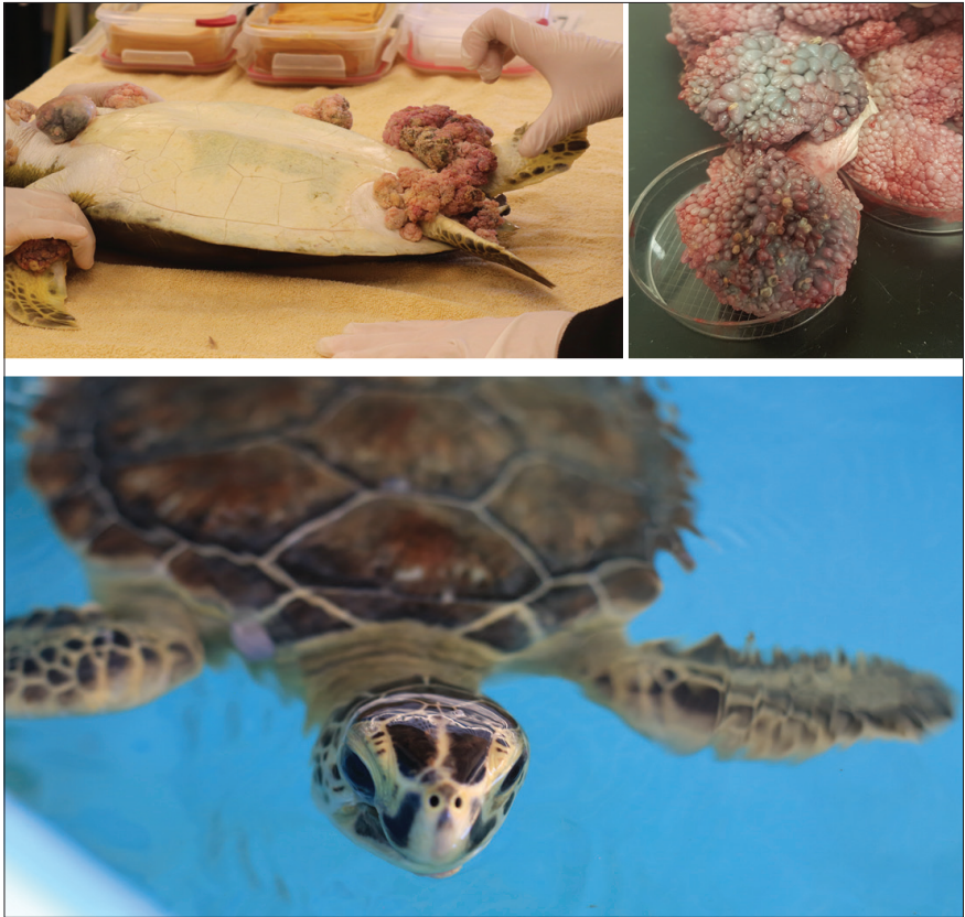
Fig. 1. Green turtles ( C. mydas ) at the UF Whitney Laboratory Sea Turtle Hospital, Florida, afflicted with fibropapillomatosis tumours. Top left: juvenile green turtle being evaluated prior to surgery. Top right: fibropapillomatosis tumour after surgical excision from patient. Bottom: green sea turtle in hospital rehabilitation tank.

bearing wild turtles (Brill et al. 1995), and found that tumour-bearing turtles surfaced less frequently at night than those without tumours, suggesting that FP tumours may impact turtle respiration. Compromised respiration therefore may affect their resting and foraging behaviour, negatively impacting their energy budgets (Brill et al. 1995). Some research has been carried out into the behaviour of healthy captive green turtles (Therrien et al. 2007), but to our knowledge the behaviour of turtles being treated for FP has not been documented. In other reptile species, minimally invasive procedures such as microchipping have been found to have a prolonged effect on stress levels (Langkilde & Shine 2006). Given that surgical tumour removal is more invasive than microchipping, it may be assumed that surgery would also have an effect on sea turtle stress levels. Although it is broadly accepted that FP