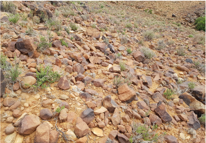
Fig. 6. Karoo dwarf tortoise mimicry.