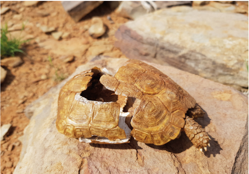
Fig. 12. Dead Karoo dwarf tortoise female that had been forcefully smashed on a rock, presumably by a bird.