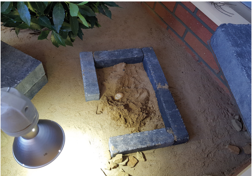
Fig.10. Nest of a captive Karoo dwarf tortoise in an artificial rock retreat (i.e. concrete cover was removed and the egg partly exposed before the photograph was made).