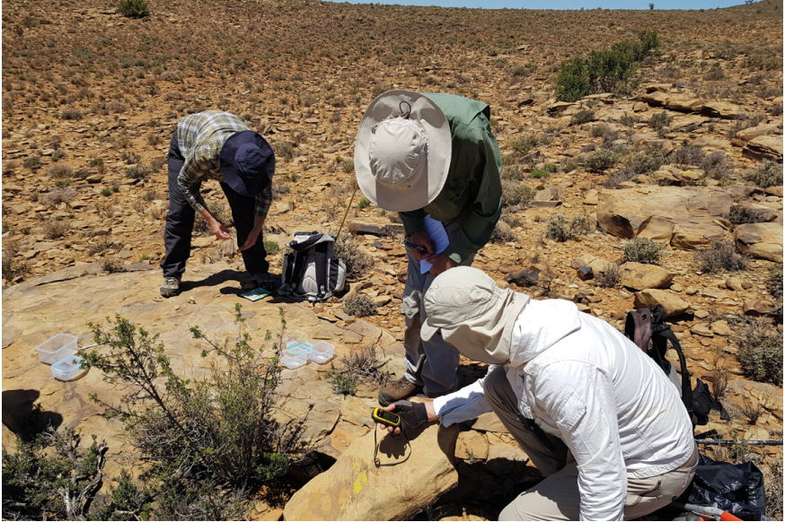
Fig. 2. Volunteers making recordings on a Karoo dwarf tortoise located at the study site.