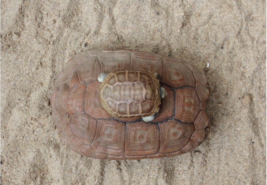
Fig. 11. Captive-bred hatchling Karoo dwarf tortoise 12 hours after hatching, with the female that had produced the egg.