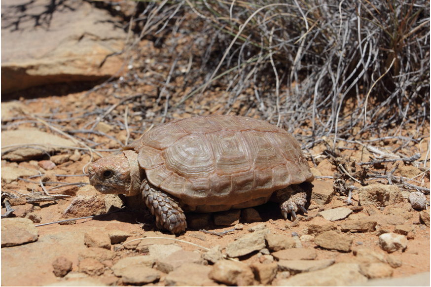
Fig. 1. Karoo dwarf tortoise male.

1999; Boycott & Bourquin 2000). Plans for a scientific field study were accepted as early as 2005, but field surveys between 2005 and 2017 failed to locate a study site with more than one or two individuals. In February 2017, a relatively dense population was finally found by a Dwarf Tortoise Conservation volunteer group, so that the anticipated field study could start after obtaining all required permissions.