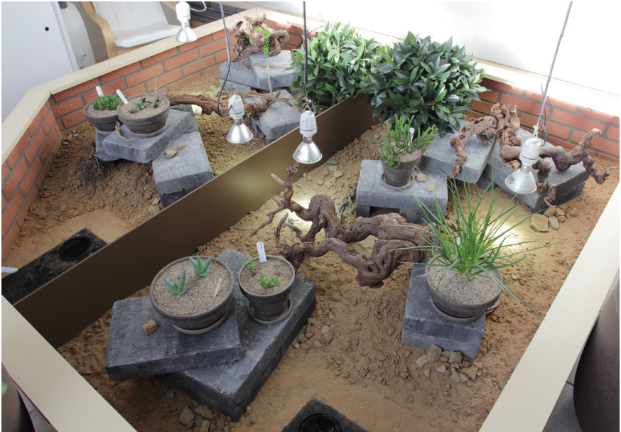
Fig. 9. Two enclosures for wild-caught Karoo dwarf tortoises. Each enclosure measured approximately 2m 2 and was placed in a climate-controlled room.