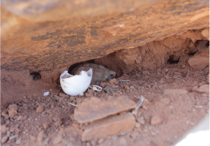
Fig. 5. Hatchling Karoo dwarf tortoise with its eggshell.