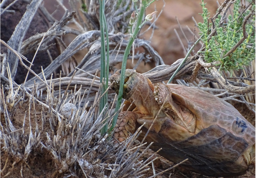
Fig. 7. Karoo dwarf tortoise feeding on a slime-lily ( Albuca sp.).