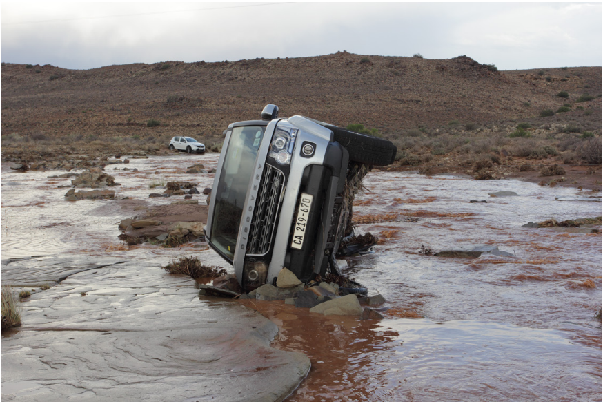
Fig. 3. Two vehicles washed down during flash flooding in summer 2018.